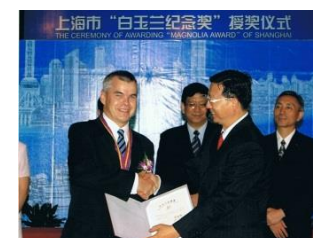
„White Magnolia Award“ of Shanghai